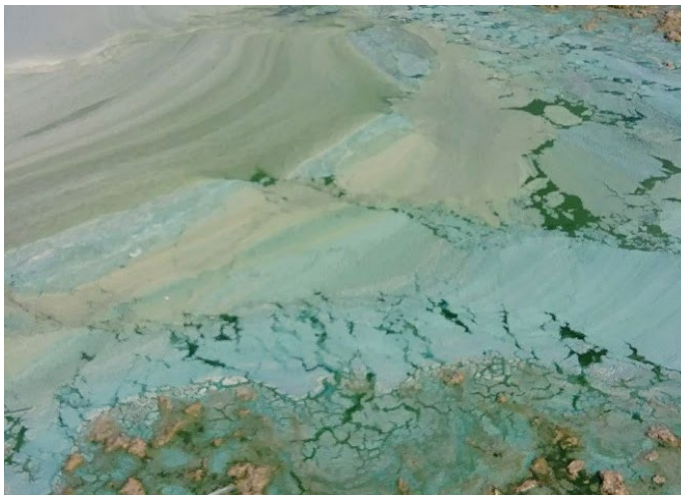
Decaying bloom material