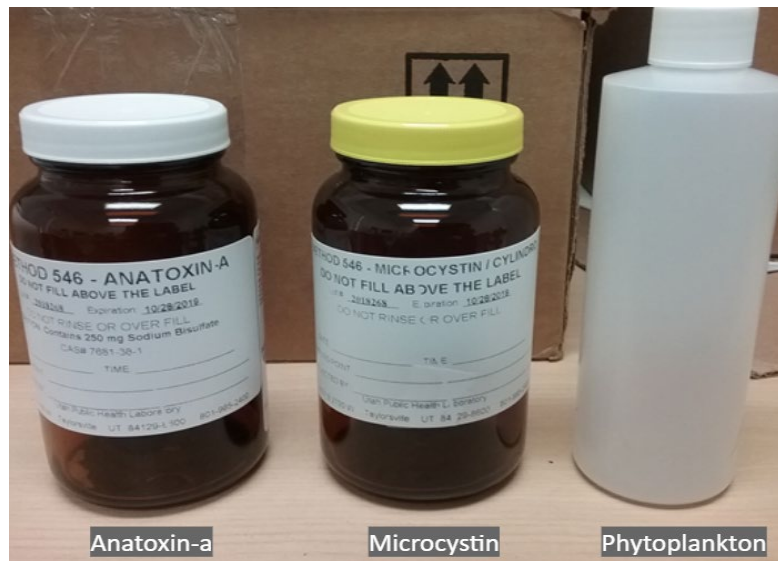
Figure 1: HAB Sample Bottles